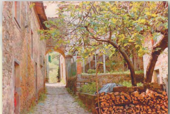
My father's village, Medicina

In a rather average suburb of Chicago circa 1968, he had flowers and grapevines and figs and fruit trees. My bedroom window was always perfumed with the fragrance of wisteria and bridal wreath. There was a quince tree outside our back door. He grew salad behind the swimming pool. (We were working class, but we had a swimming pool. His friends from his Italian village built it for him.) He would send me out into the lawn to harvest dandelion leaves for the salad. He cooked breakfast outside on his hand-built brick grill with a 1-inch thick iron plate—sautéing potatoes and eggs in olive oil.